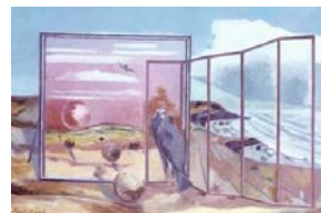
( Landscape From a Dream, Paul Nash, 1938 )